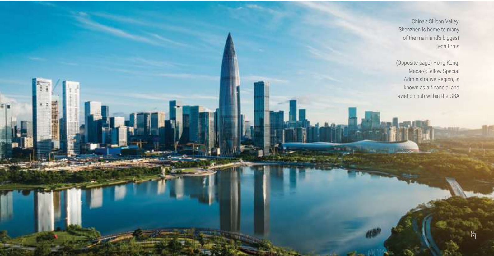
China’s Silicon Valley, Shenzhen is home to many of the mainland’s biggest tech firms

Guided by Xi’s vision, Macao is embracing an open and pragmatic approach to economic diversification that combines internal strengths, cross-boundary cooperation and global outreach. By consolidating its role as a bridge between China and PSCs, Macao is advancing its own economic transformation and positioning itself as a key player in the GBA while ultimately contributing to China’s broader national development goals. ●