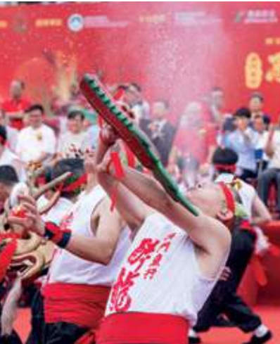
COVER IMAGE A parade participant expels rice wine from his mouth during the Festival of the Drunken Dragon, one of Macao’s most beloved and boisterous annual events