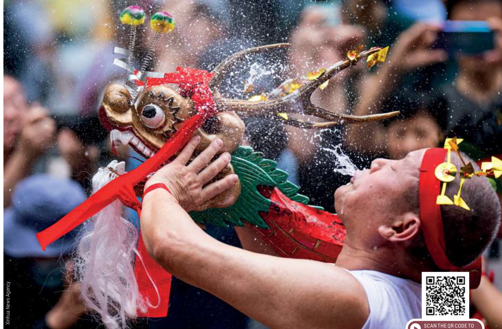
Xinhua News Agency

"The Drunken Dragon Festival symbolises the unity and love among the people of Macao, and sharing the rice spreads this blessing and love," he notes. ●