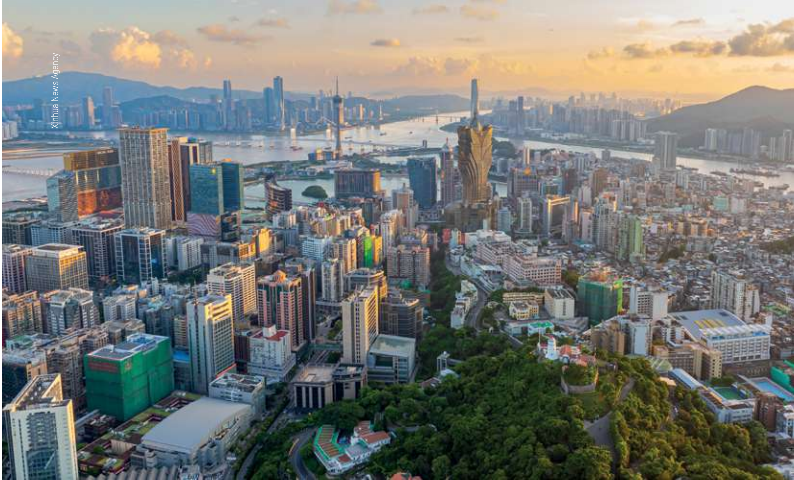
Xinhua News Agency

The science and technology park would focus on fostering innovation, supporting high-tech industries, and serving as a launchpad for mainland tech firms looking to expand internationally. It was also expected to attract global innovation projects.