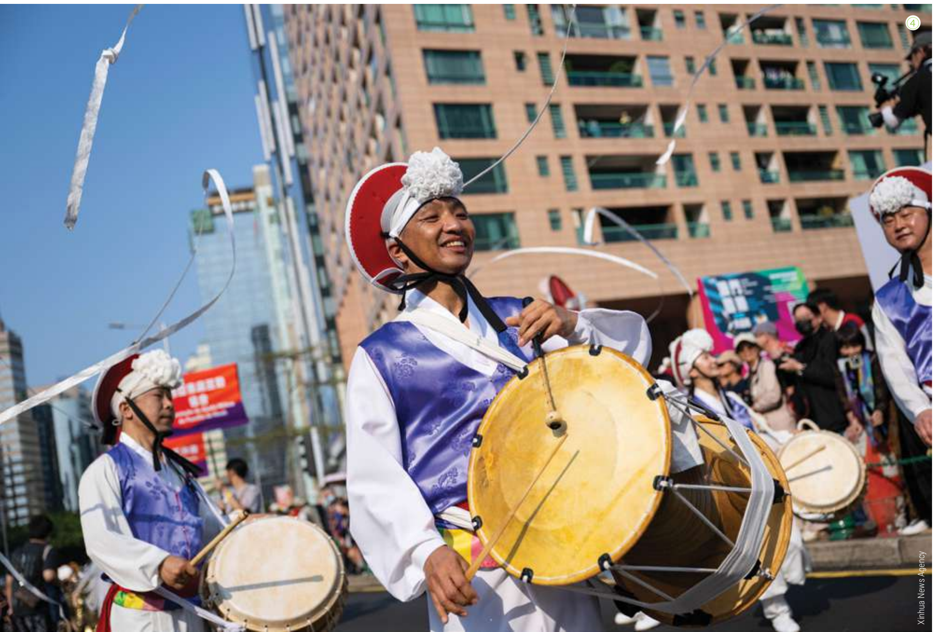
④ Music is a big part of the event, which dances along to the beat of drummers