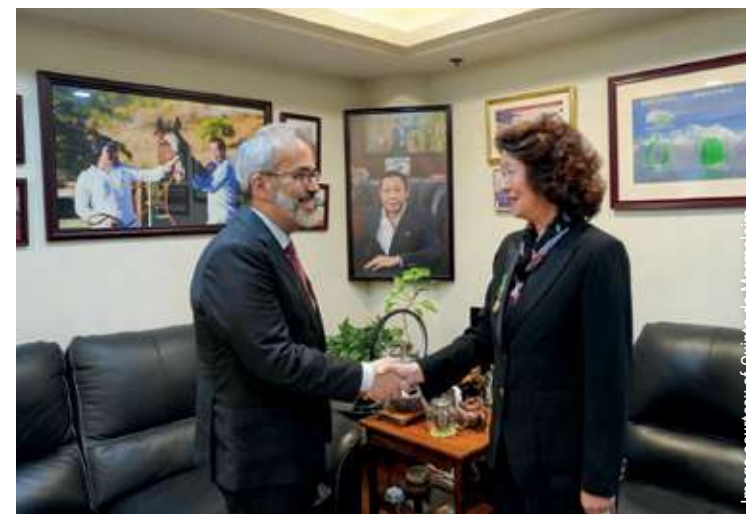
Portugal's Minister of State and Foreign Affairs Paulo Rangel (left) met with Lao Chao Peng while in Macao, recognising the influential role of her late husband and Quinta da Marmeleira

We also trust that Portugal and other European nations will continue to offer a fair and equitable business environment for Chinese enterprises, enabling both sides to advance together for mutual benefit. ●