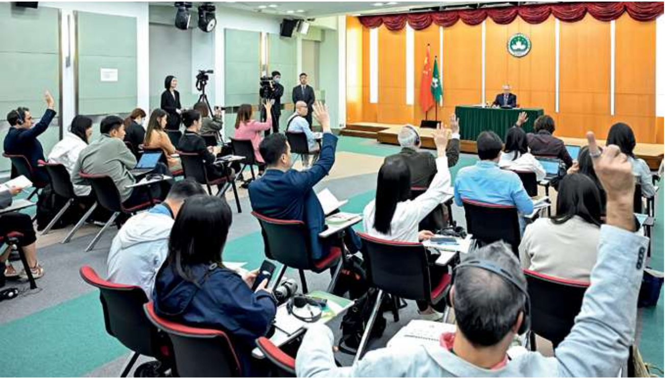
Government Information Bureau

The proposed tourism and cultural zone was intended to reinforce Macao's status as a World Centre of Tourism and Leisure while promoting cultural exchange. Key facilities envisioned include the Macao National Cultural Museum, the Macao International Performing Arts Centre, and the International Contemporary Art Museum.