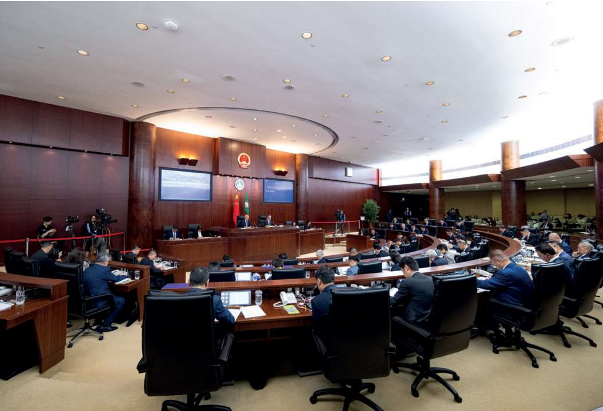
The Policy Address took place at Macao's Legislative Assembly

Closer to home, Sam emphasised Hengqin's central role in Macao's diversification strategy. The 106-square-kilometre island, part of Zhuhai Municipality, provides Macao with much-needed space to develop. Sam said his administration would work diligently towards achieving Hengqin's second-stage development goals by 2029. These relate to regulatory harmonisation between Macao and the Cooperation Zone, efficient cross-boundary flows, and support for Macao's emerging industries – traditional Chinese medicine (TCM), modern financial services, high-tech industries and large-scale event hosting.